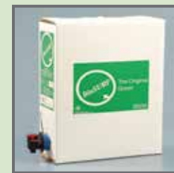
Bag-in-a-Box dispensing of BioSURF

kill expected by patients and clinicians on clinical surfaces, there are three components of surface disinfection that must be present, effective, and compatible with each other. These components are: (1) The disinfectant formulation, (2) The packaging and dispensing, (3) The wipe material. After 40+ years of a worldwide search that includes extensive microbial testing of now 190+ products, one has finally met the necessary essentials in all three surface disinfectant components. The following report describes and lists steps in use of the newest BioSURF environmental surface disinfectant.